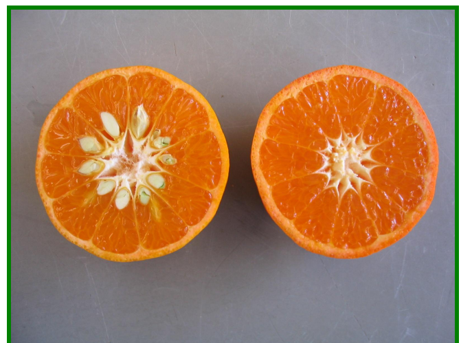
W. Murcott (left) and Tango (right) fruit (mixed block planting - UC Riverside)